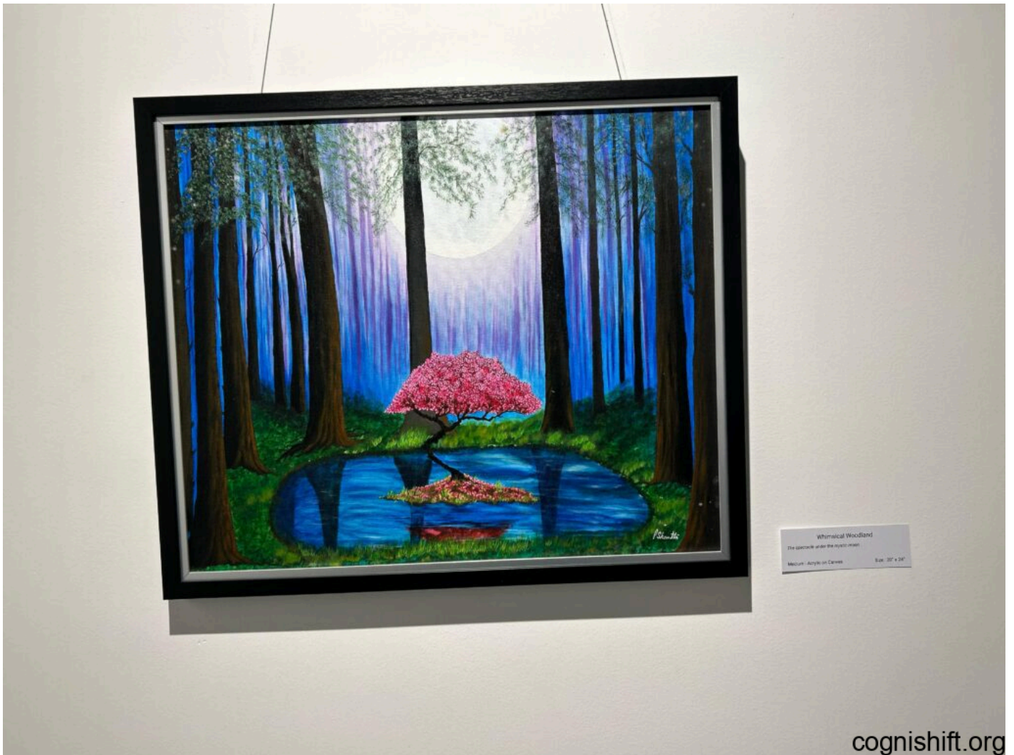
Whimsical Woodland The landscape under the night moon Medium - Acrylic on Canvas Size - 30" x 24"